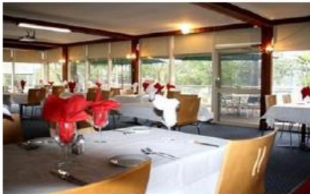
Kempsey Motor Inn