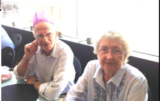
Redlands group enjoying Christmas lunch