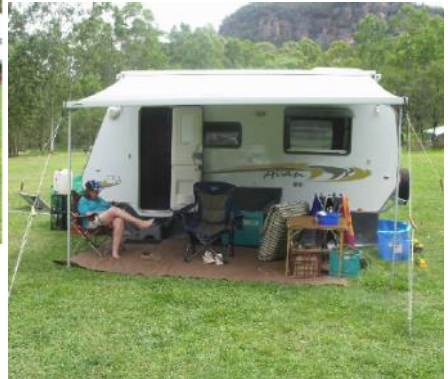
Crest Blue Mountains enjoying the Wolgan Valley over the Christmas Break